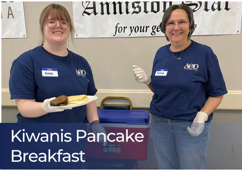
Kiwanis Pancake Breakfast