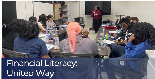
Financial Literacy: United Way