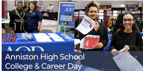
Anniston High School College & Career Day