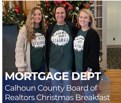
MORTGAGE DEPT. Calhoun County Board of Realtors Christmas Breakfast