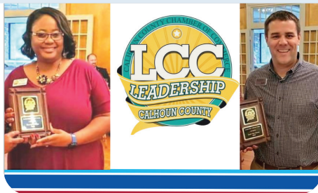
Congratulations to the Leadership Calhoun County Graduates!