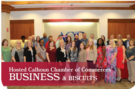
Hosted Calhoun Chamber of Commerce's BUSINESS & BISCUITS