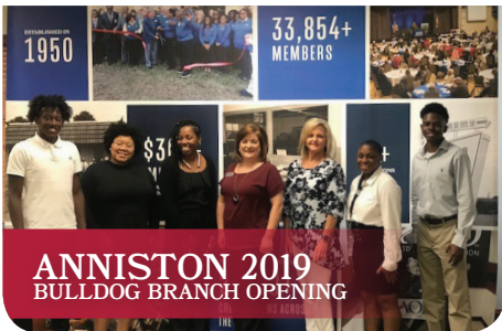
ANNISTON 2019 BULLDOG BRANCH OPENING