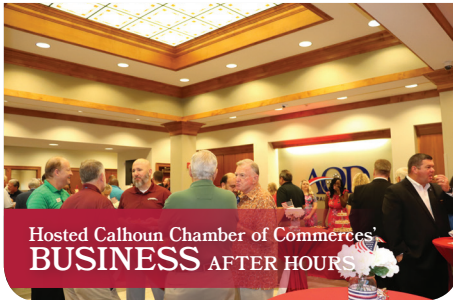
Hosted Calhoun Chamber of Commerce's BUSINESS AFTER HOURS