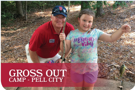
GROSS OUT CAMP - PELL CITY