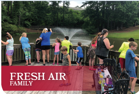
FRESH AIR FAMILY