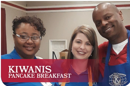
KIWANIS PANCAKE BREAKFAST