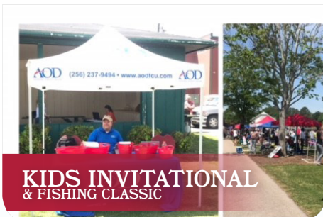
KIDS INVITATIONAL & FISHING CLASSIC

A non-profit organization which hosts an annual fishing tournament for students with intellectual disabilities in schools across Calhoun and Cleburne County.