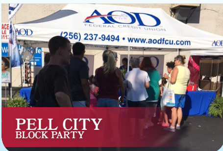
PELL CITY BLOCK PARTY