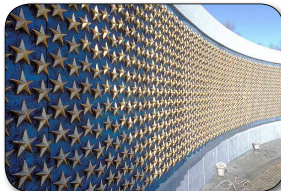
Field of Stars

AODFCU would like to honor the spirit, sacrifice, and commitment of members who served in the U.S. armed forces during World War II. If you are a WWII veteran or have a relative who is an AODFCU member and served during World War II, AODFCU would like to honor them on the AODFCU World War II Honor Roll which will be featured in the annual report.